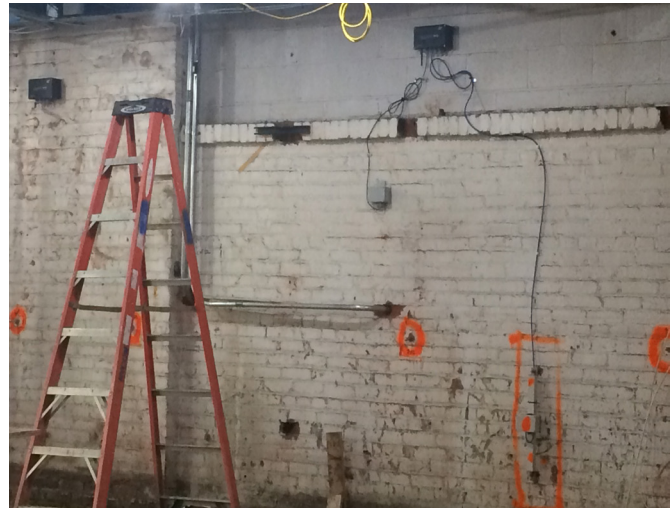
Tilt meter and beam sensor connected to wireless tilt meter with in-built datalogger

Model EDS-20V-AW arc weldable strain gage were evenly spaced across the second story W-beam, located parallel at the top of the perimeter wall. The data was collected by model ESDL-30 datalogger that transmitted the data wirelessly to central server via cellular network.